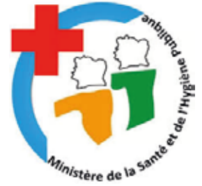
Dr. Raymonde GOUDOU COFFIE

Minister of Health and Public Hygiene Ivory Coast